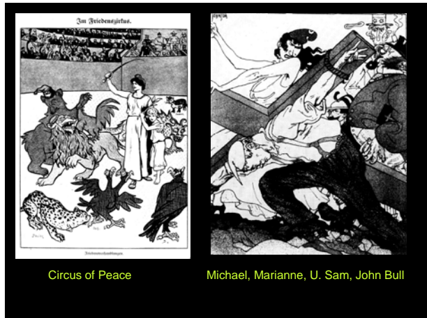
Circus of Peace