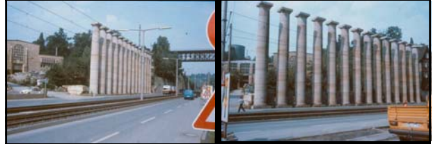
Memorial planned in Berlin for Axis victory Stuttgart - Bad Cannstatt