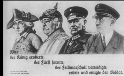
Friedrich II Bismarck Hindenburg Hitler

What the king rescued The Prince shaped The Field Marshal defended The Soldier rescued and united.