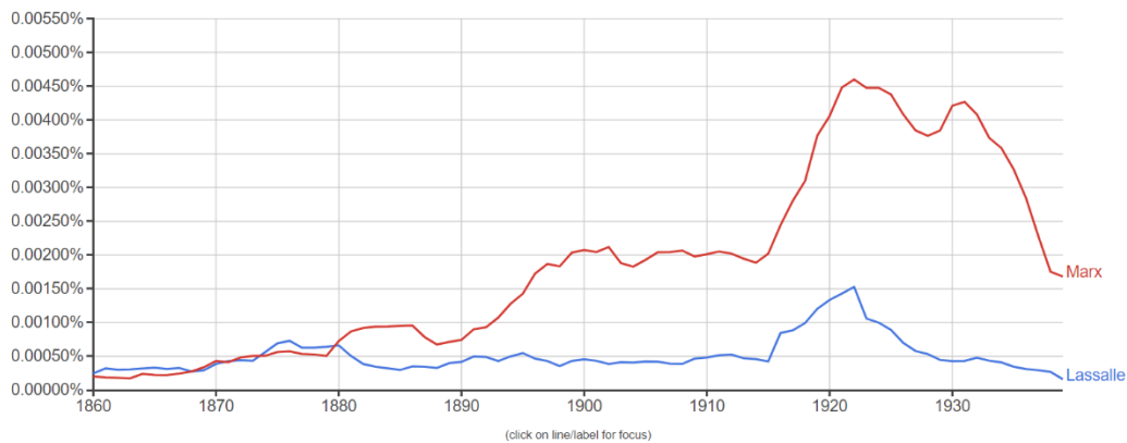
Google Ngram's graph representing the discussion of Marx and Lassalle in German literature (1860-1939)