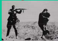
Individual murder (also 2008)