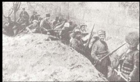
Apr. 1915: armed Armenian forces hold out at Van