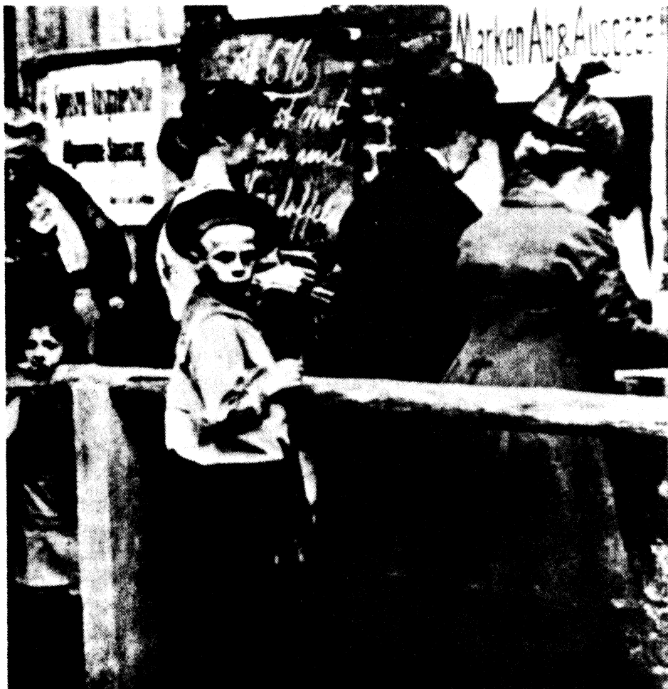
Berlin soup kitchen, 1916. Photograph from Annemarie Lange, Das wilhelminische Berlin (East Berlin, 1967).

known in exceptional cases. The whole body is attacked simultaneously, and the illness in this form is practically incurable. . . . Tuberculosis is nearly always fatal now among adults. It is the cause of 90 per cent of the hospital cases. Nothing can be done against it owing to lack of foodstuffs. . . . It appears in the most terrible forms, such as glandular tuberculosis, which turns into purulent dissolution. 64