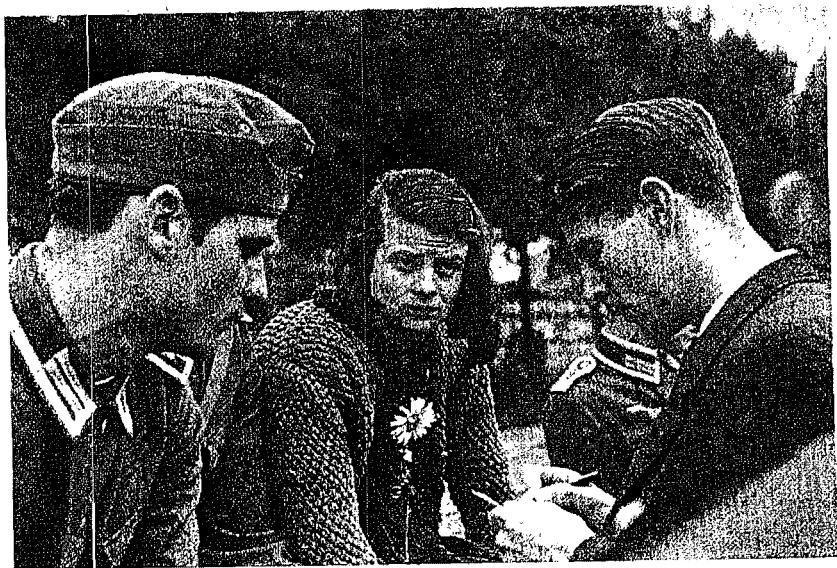
Fig. 32. Departing for Russia, left to right: Hans Scholl, Sophie Scholl, and Christoph Probst.

Alexander Schmorell was born in Orenburg, Russia, and Kurt Huber, in Chur, Switzerland. Like the rescuer Oskar Schindler, who came from the Sudetenland (Czechoslovakia), they may have been “different” from the traditional German and more open to change because of their geographic and national backgrounds. 9 Huber's philosophical training also led him to resist. In his final statement to the court, he declared,