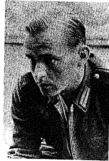
Fig. 31. Willi Graf, a medical student in the White Rose, was executed on 12 October 1943.

In 1943, resisters reacted to the Nazi order swiftly and decisively, whether in the heart of Munich or on the streets of Warsaw. To carry out their anonymous leafleting, the White Rose resisters had to abide by the guidelines of a human and ethical force that allowed them to confront "legitimate authority." Their far-reaching goal of re-creating a better Germany mitigated any fear of personal harm. The basic Christian principle of love of neighbor inspired the activity of some, especially Willi Graf.